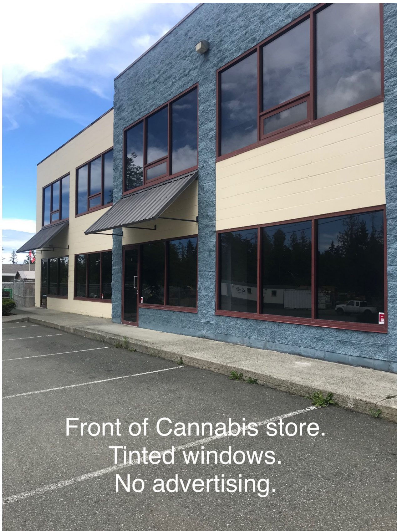
Front of Cannabis store. Tinted windows. No advertising.