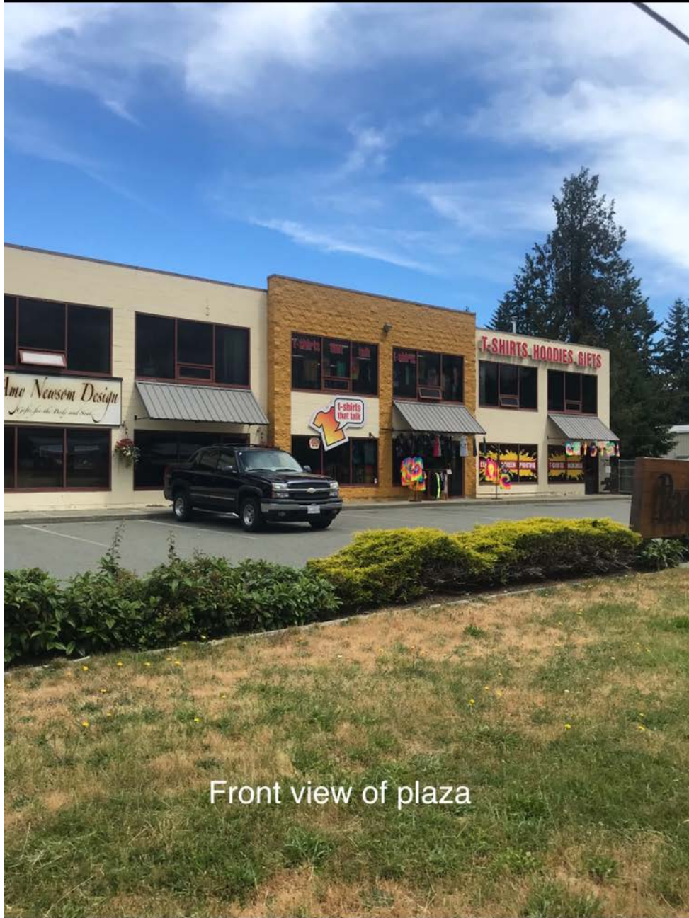
Front view of plaza