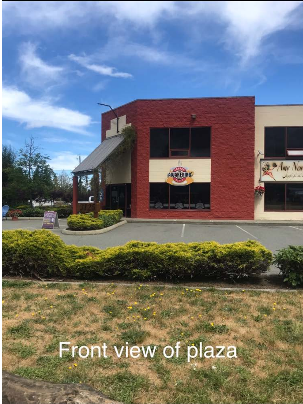
Front view of plaza