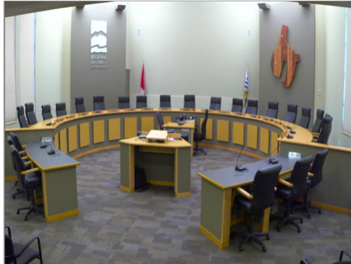
Sony camera model SNC-VM772R

An example of a fixed view from a potential camera is below.