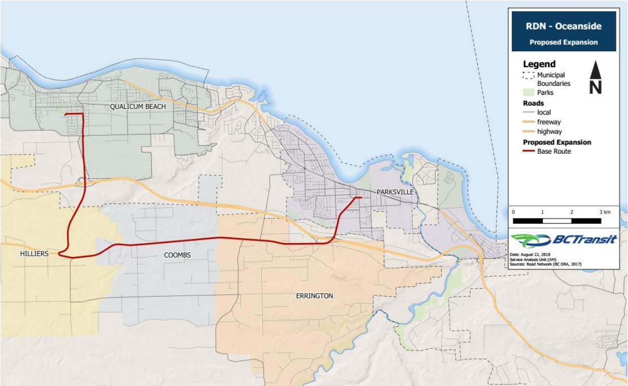
Figure 2: Service Option 1, fixed route conventional (BC Transit: Area F Feasibility Study)