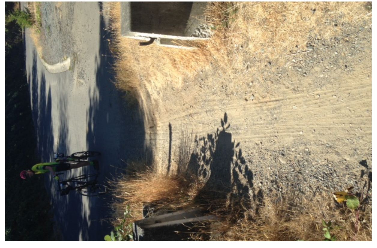
This photo is intended to highlight the hazard of the curbing connector hook; suggest it be cut off or otherwise bent or covered.