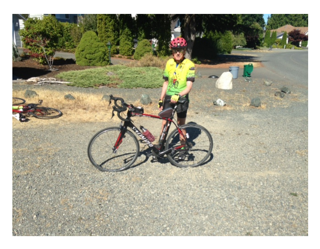
Cyclist standing amid the rounded beach stone that comprises most of the "pass through" surface.