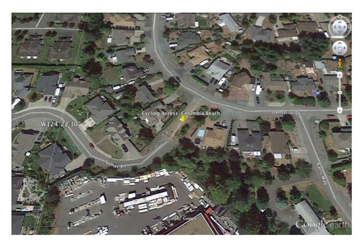
Drop Pin shows the gravel access between Sumar Lane and Dalmatian Drive