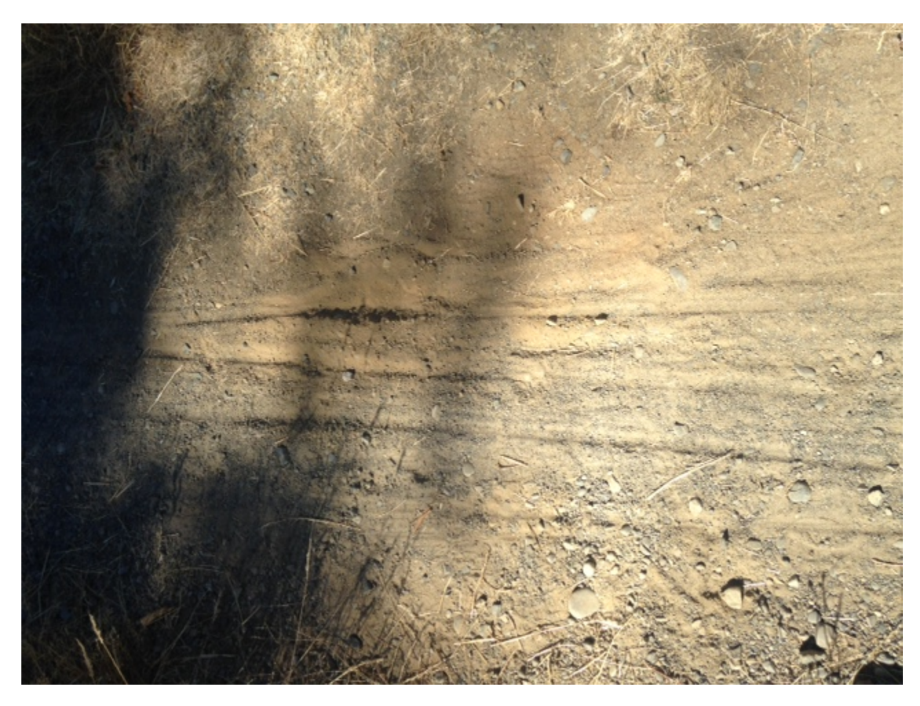
This phone shows sandy fines which, when dry, tend to make cycle control "twitchy".