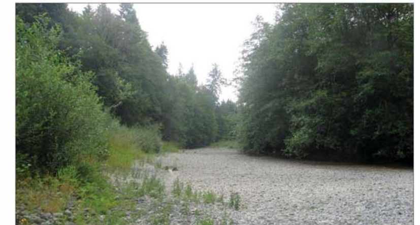
5 East channel of the Nanaimo River within the Morden Colliery Regional Trail Corridor. Future site of pedestrian bridge crossing.

NOTE: Appropriate measures to reduce impact on agricultural lands will be determined in discussion with the ALC and neighbouring land owners. Possible measures include fencing, signage, trail surfacing and trail rerouting, as required.