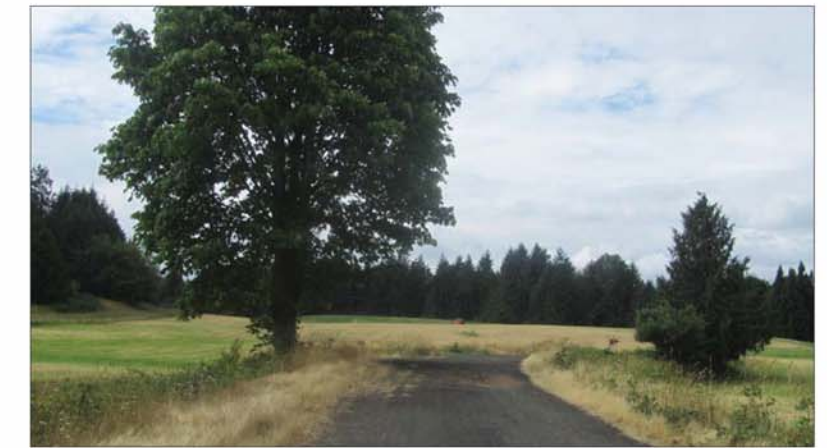
3 Looking south along the trail corridor (Provincial Crown Land) at existing gravel road accessed by neighbouring property owner.