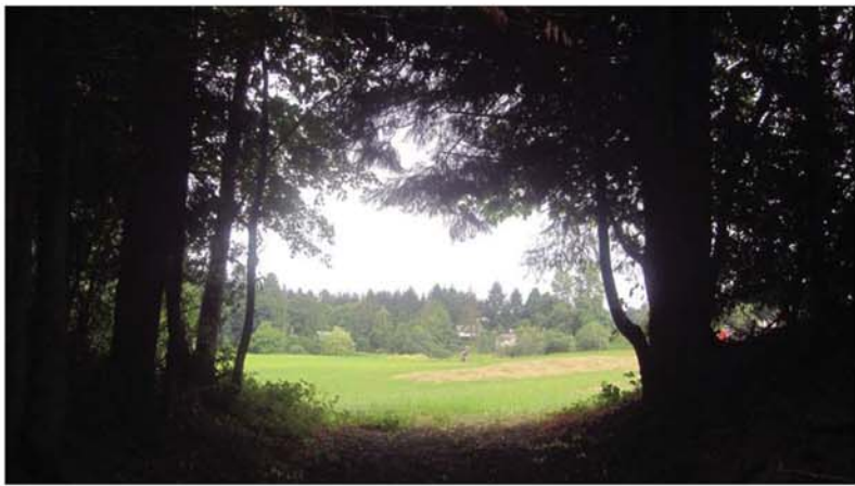
4 Looking north from the undeveloped trail corridor, through a forest clearing to adjacent hay fields.