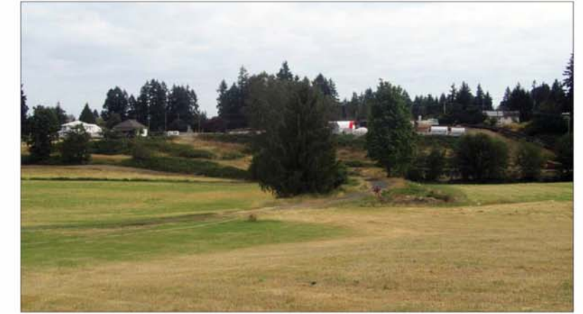
1 Looking southwest at low-lying hay fields from undeveloped trail corridor above .