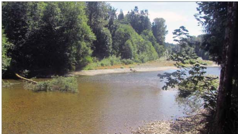
6 West channel of the Nanaimo River within the Morden Colliery Regional Trail corridor (Provincial Crown Land). Future site of pedestrian bridge crossing.