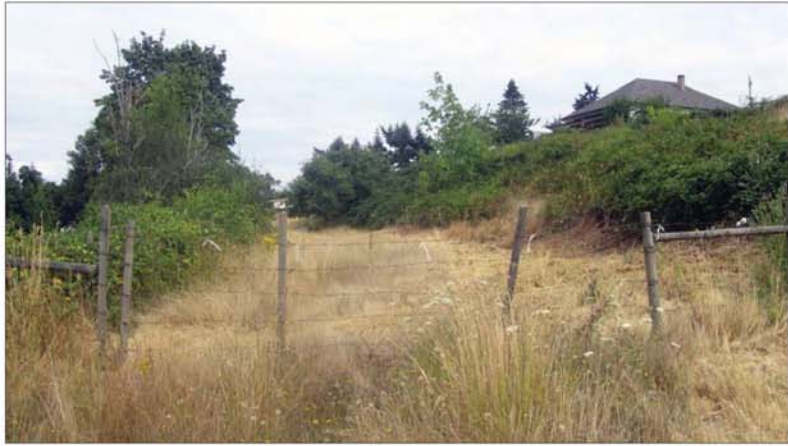
2 Looking north along the undeveloped trail corridor (Provincial Crown Land)—old railway grade.