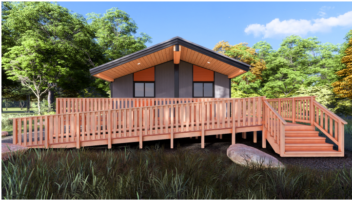
Front View of Building