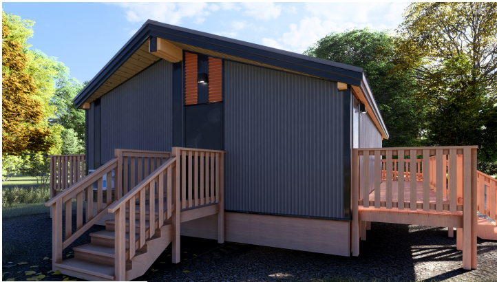
Rear of Building