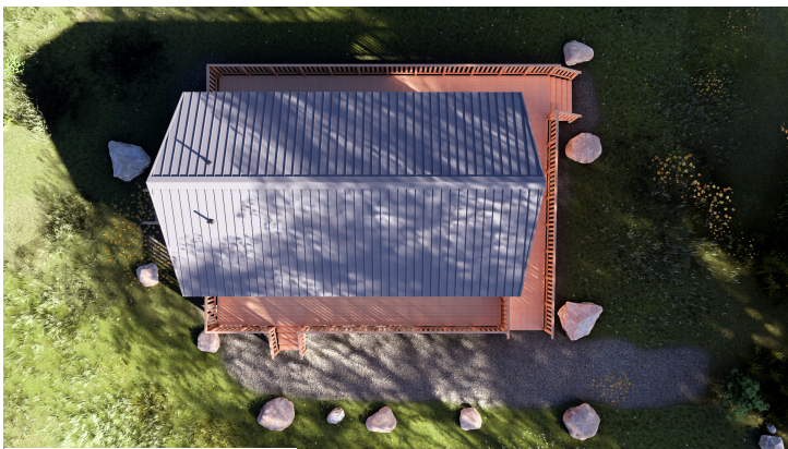
Top View of Building