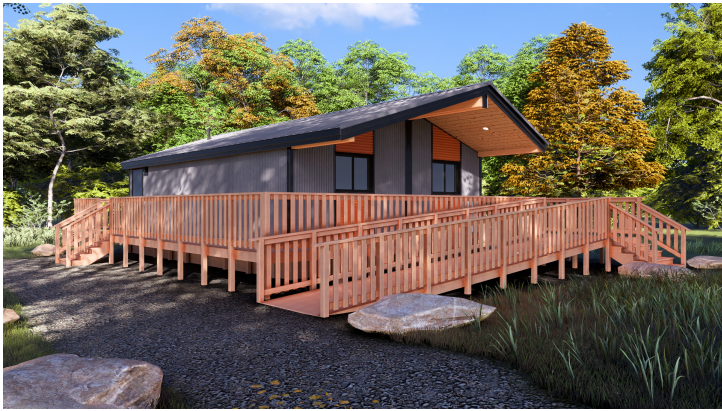
Front Approach to Building