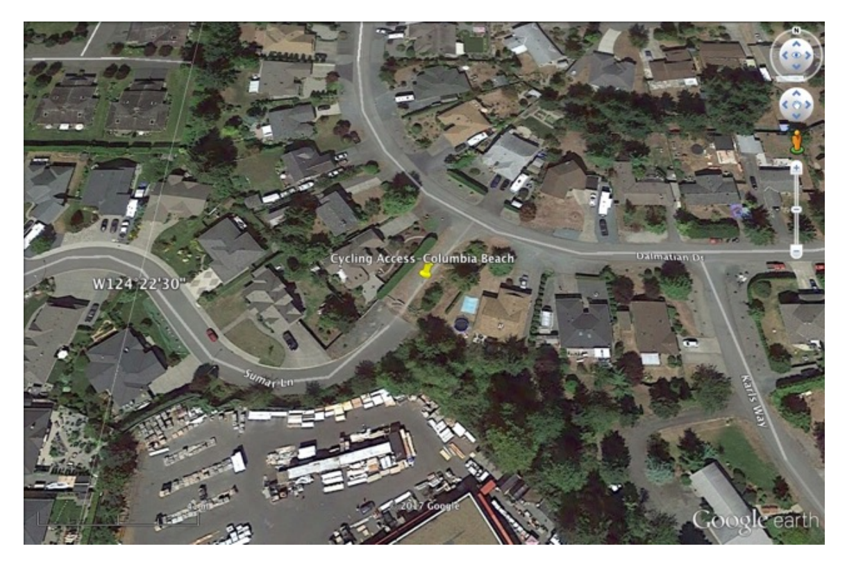
Drop Pin shows the gravel access between Sumar Lane and Dalmatian Drive